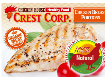
Food and beverage label